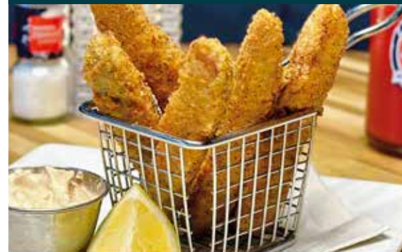
FRIED PICKLES (5) with spicy mayo