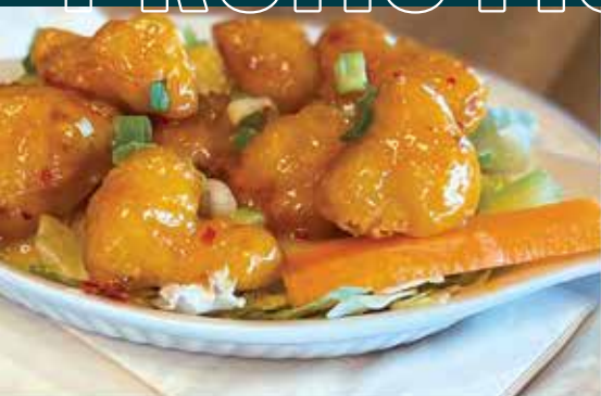
CAULIFLOWER TEMPURA DAN BANG BANG style sauce