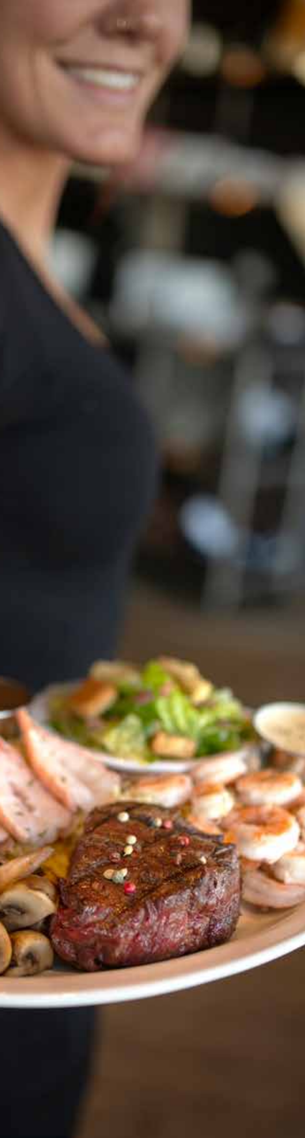
Table d'hôte 12 $

Transform your main dish in a table d'hôte for only 12$