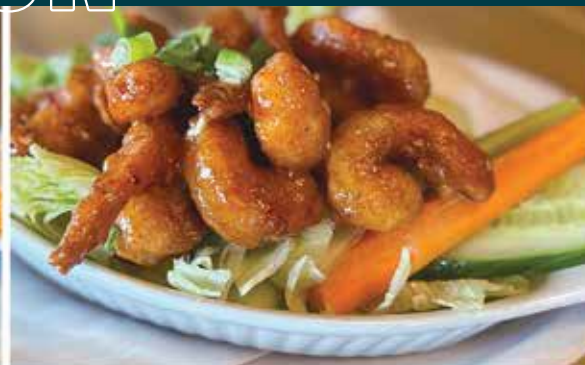
SHRIMPS (12) DAN BANG BANG style sauce